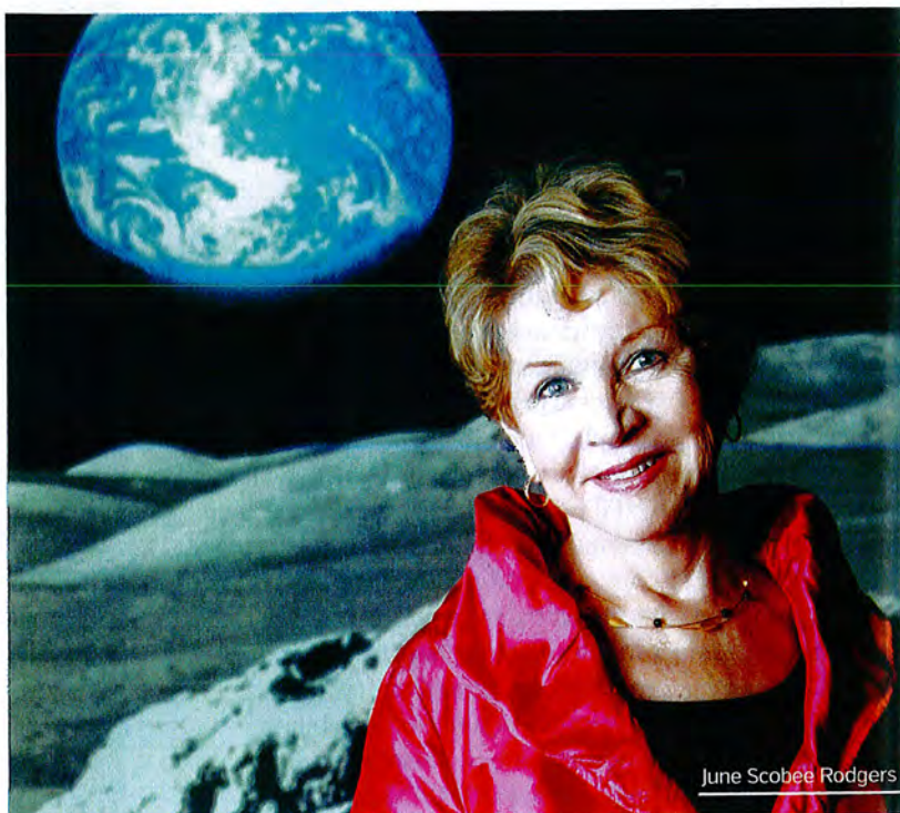
June Scobee Rodgers

About 125 men and women are expected at the conference, one of two national events sponsored annually by Executive Women International. “I hope they walk out with a better understanding of what it means to be a woman in the work environment today,” spring confer-